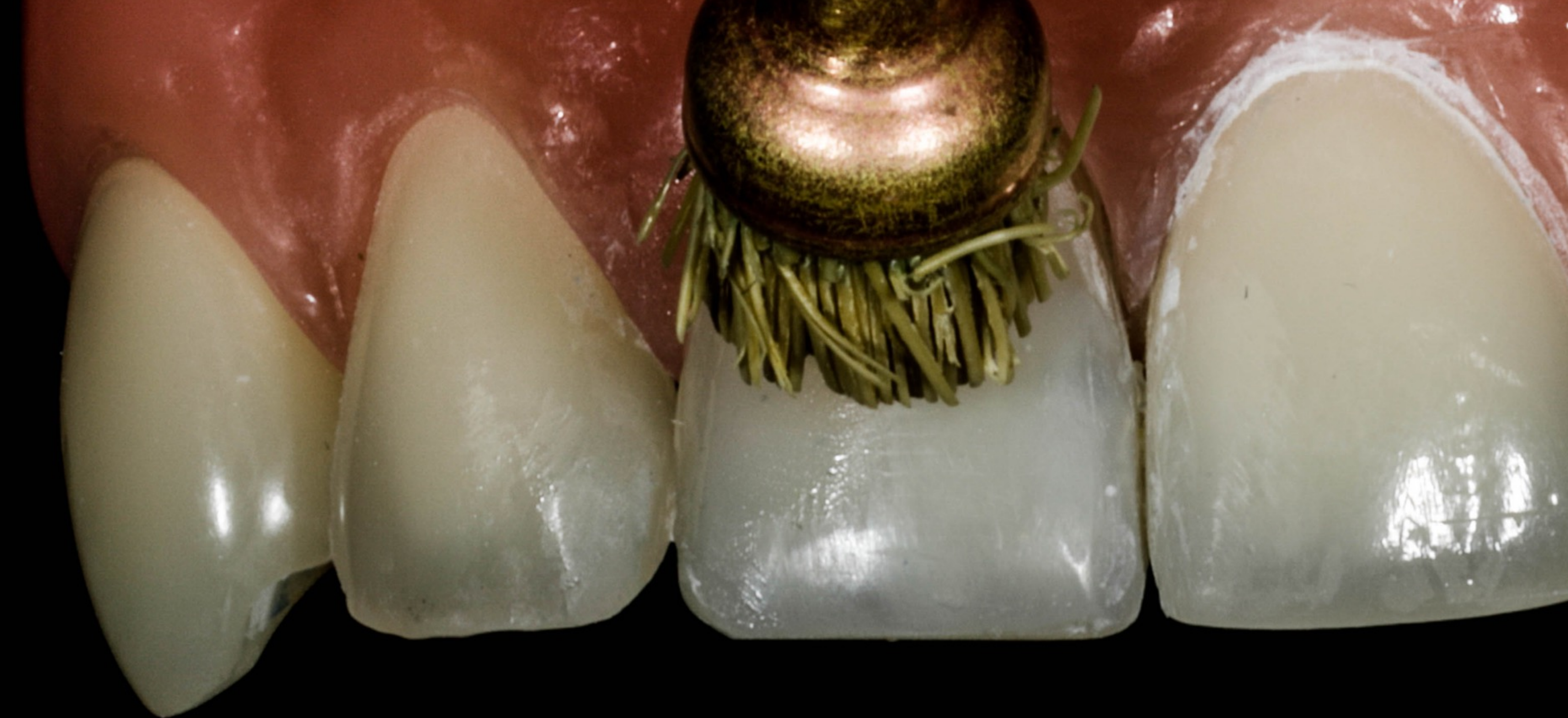
Finish & Polish